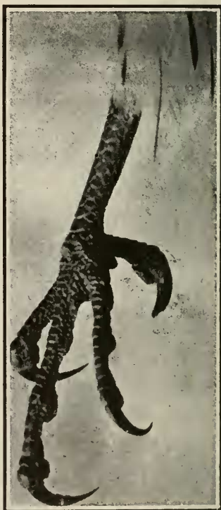
Falco columbarius , Pigeon Hawk. (No. 520 collection of W. F. H., April 10, 1895, Cameron Co., Texas.)